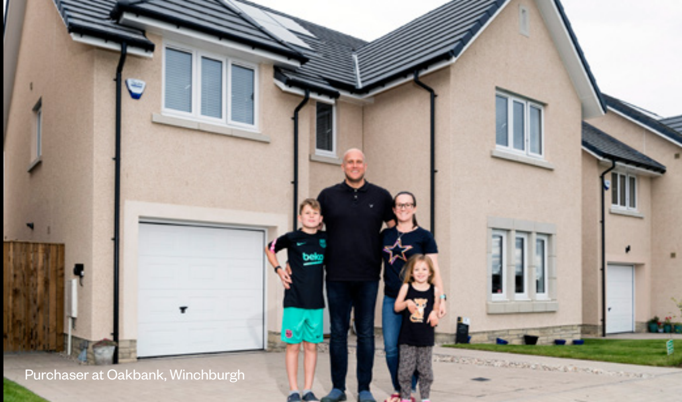
Purchaser at Oakbank, Winchburgh