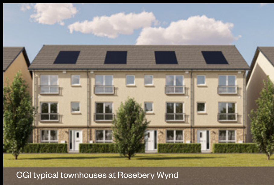
CGI typical townhouses at Rosebery Wynd