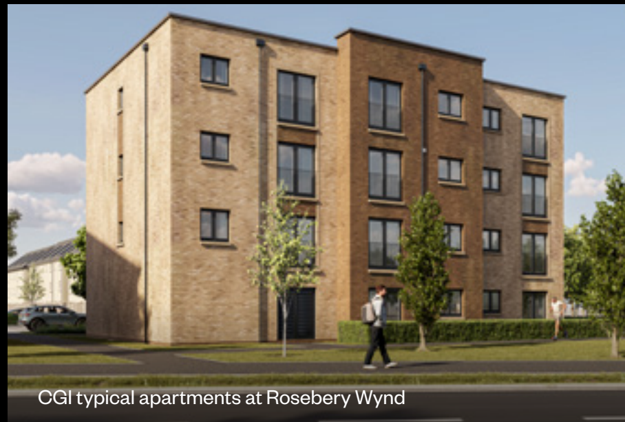
CGI typical apartments at Rosebery Wynd