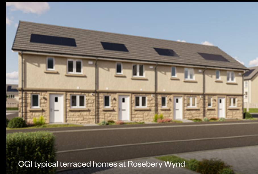
CGI typical terraced homes at Rosebery Wynd