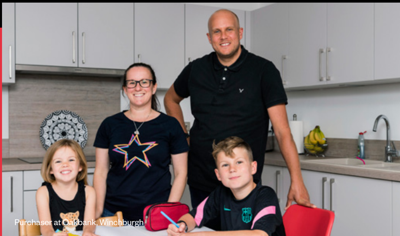
Purchaser at Oakbank, Winchburgh

See more customer stories, reviews and ratings >