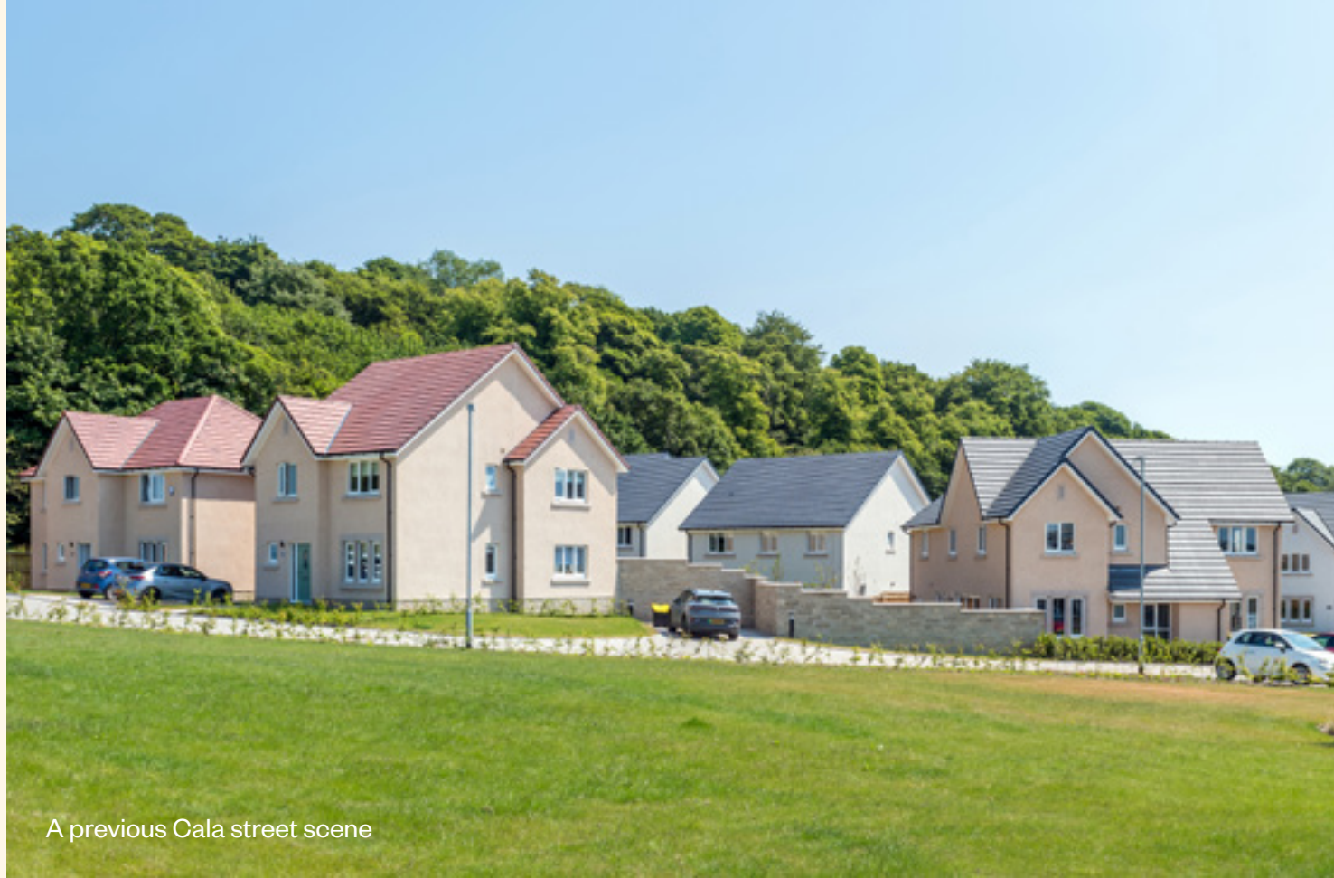
A previous Cala street scene